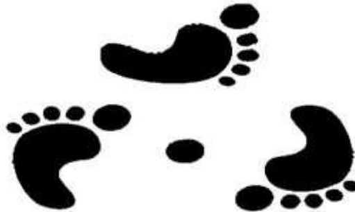
Figure 2. How to perform three steps turning method on each of the track end.