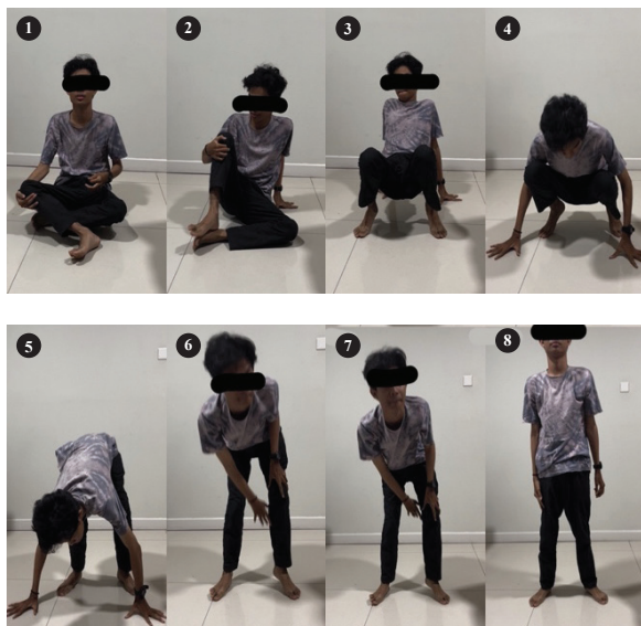
Figure 1. Gower’s sign

When he sat on the floor and started to stand, he had to hold onto the floor and then both knees, as in Figure 1.