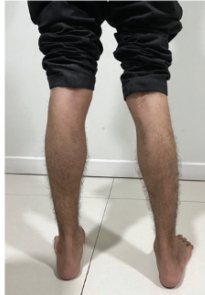
Figure 2. Calf pseudohypertrophy

This condition is called gower’s sign. We also found calf pseudohypertrophy, as seen in Figure 2.